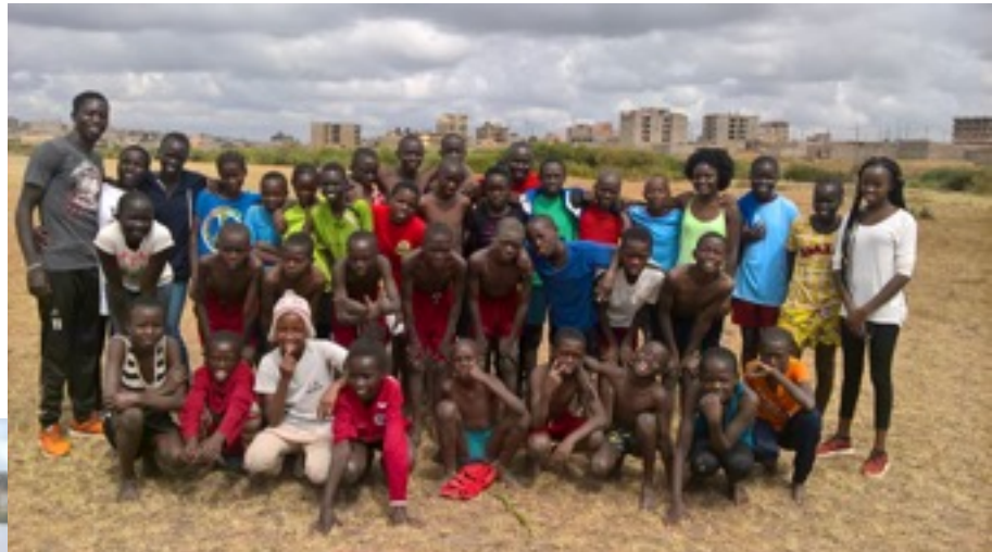
Hiking tour to Witheithe

The first half of the year with the selection teams of girls and boys in pictures