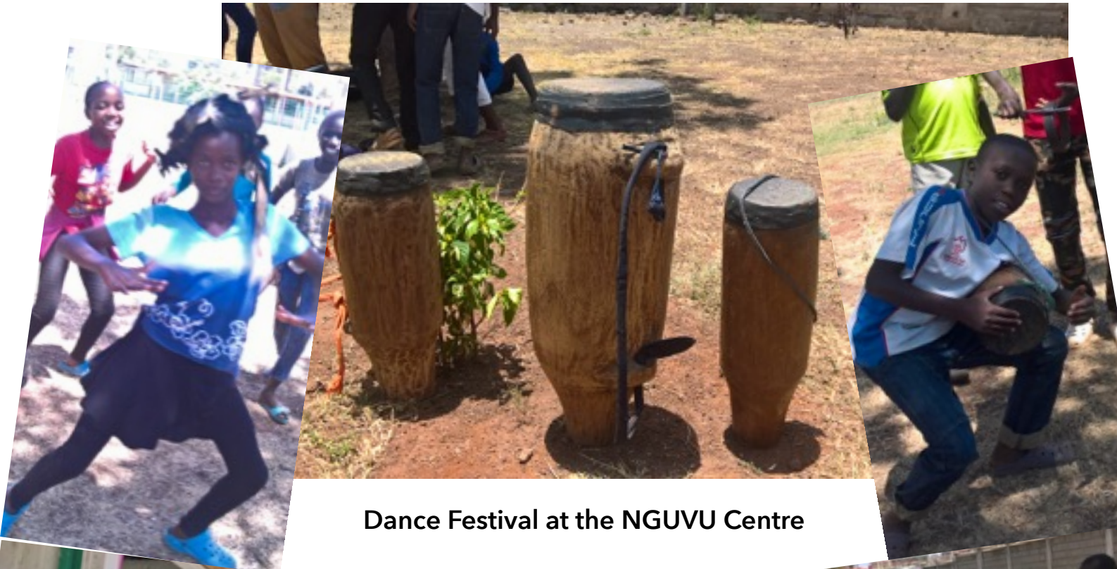
Dance Festival at the NGUVU Centre