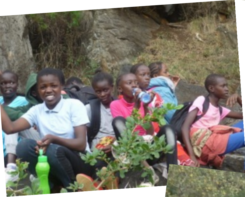
Hiking tour to Kilimambogo