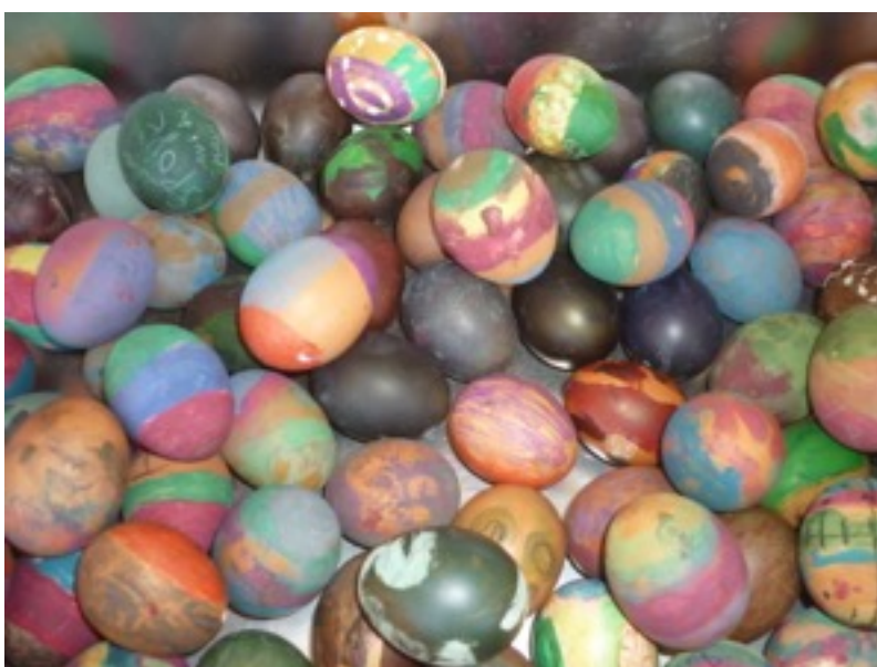
Eastertime at the NGUVU Centre