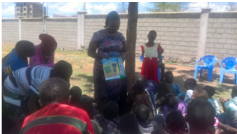
Health and Prevention Workshop at the NGUVU Centre in cooperation with the Gachororo Health Centre